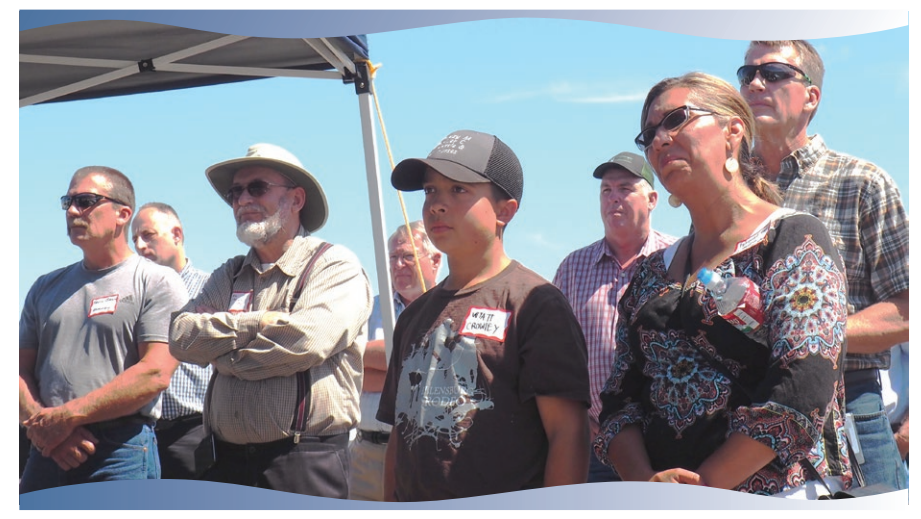
Attendees hear from dignitaries at the Lind Coulee Complex Celebration.

Both siphons have a 14'8" inside diameter and have water capacity of around 3,310 cubic feet per second. Lind Coulee Siphon Number 1 is 1,885 linear feet with over 800,000 pounds of steel for reinforcing and 6,302 cubic yards of concrete. Lind Coulee Siphon Number 2 is 2,598 linear feet with over 1,669,300 pounds of steel reinforcing and 8,703 cubic yards of concrete. The siphons expand the water delivery capacity of East Low Canal, the source of water for OGWRP.