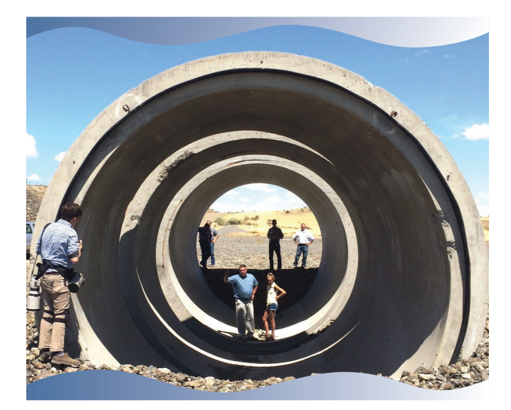
View of ECBID Manager Craig Simpson standing inside the Lind Coulee test section.

Both siphons have a 14'8" inside diameter and have water capacity of around 3,310 cubic feet per second. Lind Coulee Siphon Number 1 is 1,885 linear feet with over 800,000 pounds of steel for reinforcing and 6,302 cubic yards of concrete. Lind Coulee Siphon Number 2 is 2,598 linear feet with over 1,669,300 pounds of steel reinforcing and 8,703 cubic yards of concrete. The siphons expand the water delivery capacity of East Low Canal, the source of water for OGWRP.