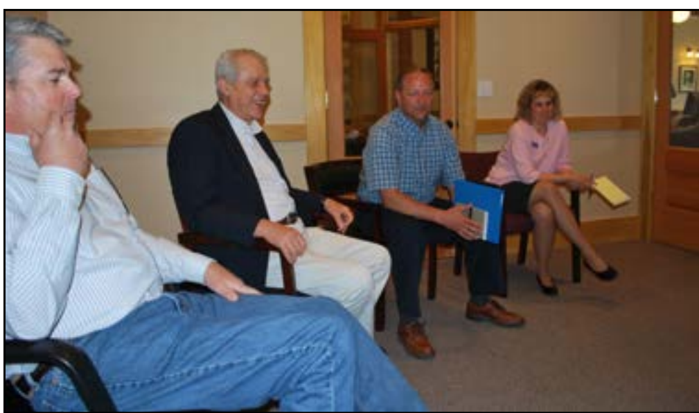
CBDL members visiting Columbia Bank in Ritzville to continue their outreach efforts.

The League continued outreach efforts last month visiting the Washington Bankers Association, Sterling Bank in Moses Lake, Bank of America in Spokane, the Odessa Chamber, Agribusiness Council in Spokane and Columbia Bank in Ritzville. Next month the League is planning on taking their outreach efforts to Inland Power and Light, and to Agri-